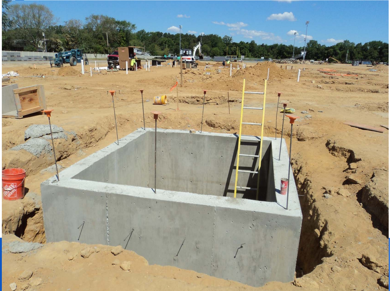
F&G Elevator Pit