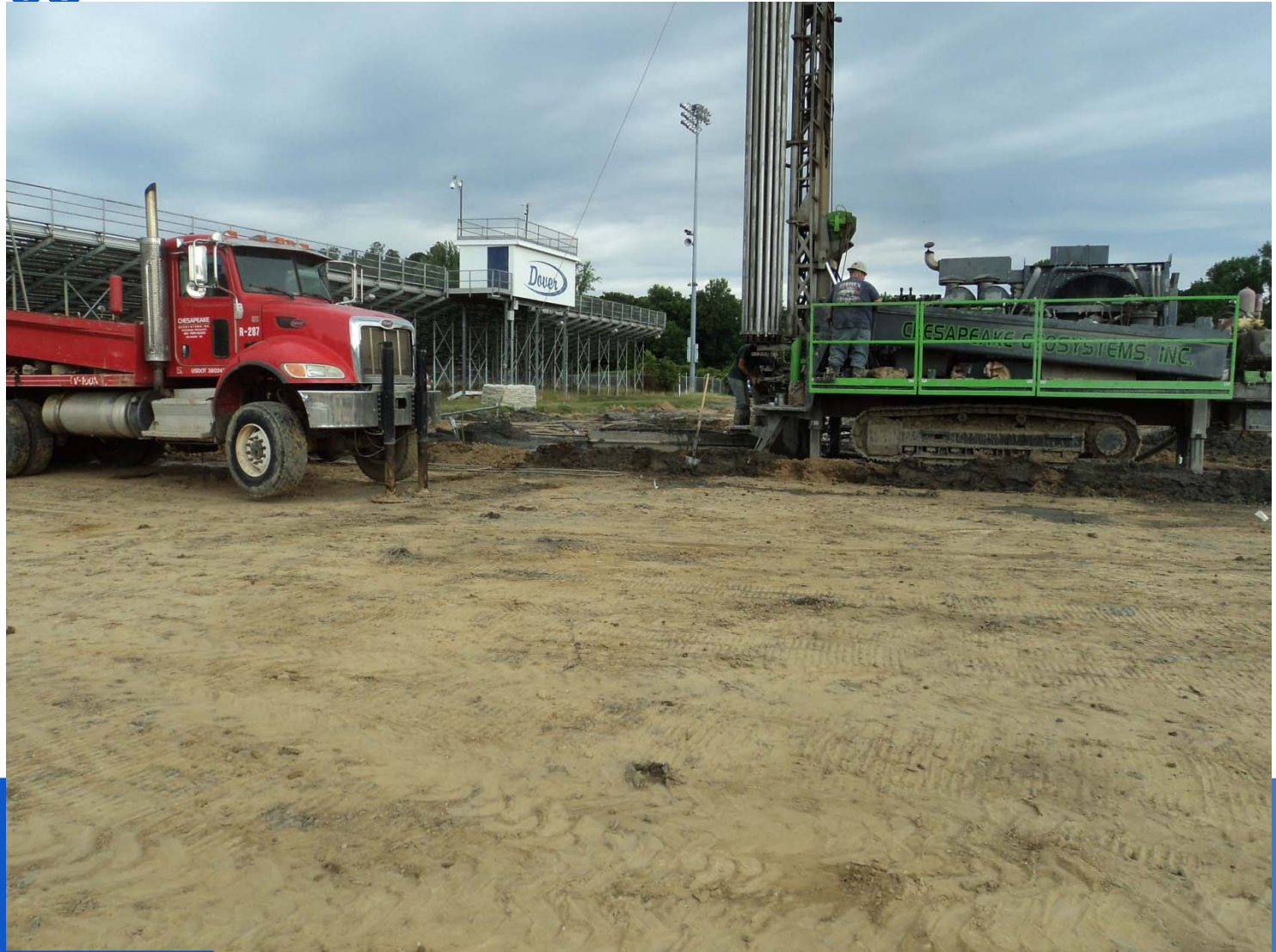
GEO THERMAL Well Drilling

CAPITAL SCHOOL DISTRICT TWO INTERCONNECTED MIDDLE SCHOOLS